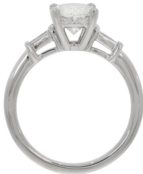
Photographs of jewelry style. Images not actual size. *Gram weights may change after final polishing or resizing.