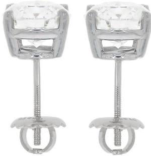
Photographs of jewelry style. Images not actual size. *Gram weights may change after final polishing.