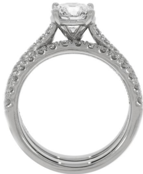
Photographs of jewelry style. Images not actual size. *Gram weights may change after final polishing or resizing.