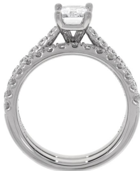
Photographs of jewelry style. Images not actual size. *Gram weights may change after final polishing or resizing.