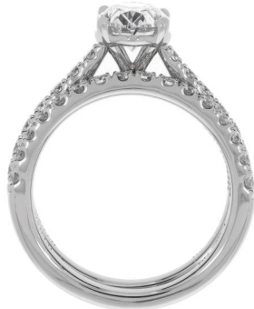
Photographs of jewelry style. Images not actual size. *Gram weights may change after final polishing or resizing.