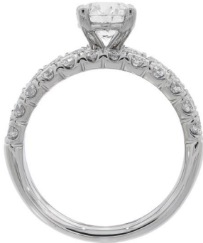
Photographs of jewelry style. Images not actual size. *Gram weights may change after final polishing or resizing.