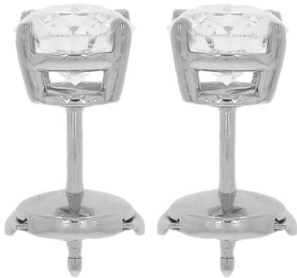
Photographs of jewelry style. Images not actual size. *Gram weights may change after final polishing.