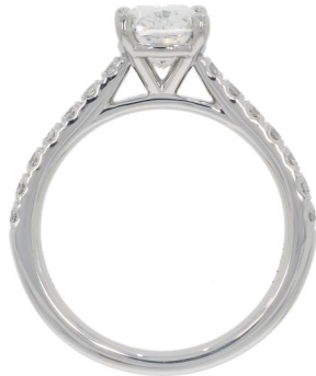
Photographs of jewelry style. Images not actual size. *Gram weights may change after final polishing or resizing.