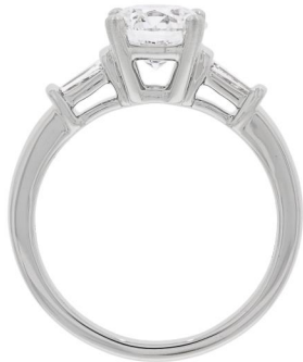
Photographs of jewelry style. Images not actual size. *Gram weights may change after final polishing or resizing.