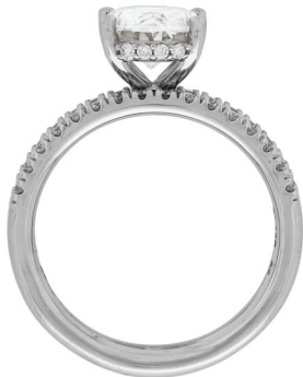
Photographs of jewelry style. Images not actual size. *Gram weights may change after final polishing or resizing.