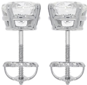
Photographs of jewelry style. Images not actual size. *Gram weights may change after final polishing.