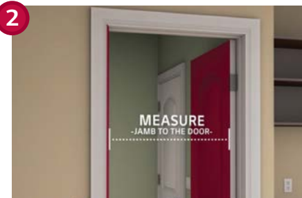
Measure each door from jamb to jamb.