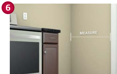
Measure the Depth.