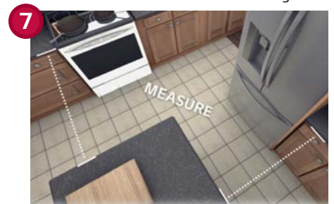
Measure the clearance for desired path.