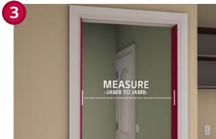
Plan to remove the door(s).