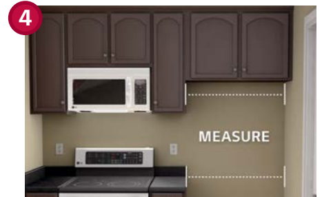
Measure the width of the opening at the countertop, under the upper cabinets and at the base if there is a molding.