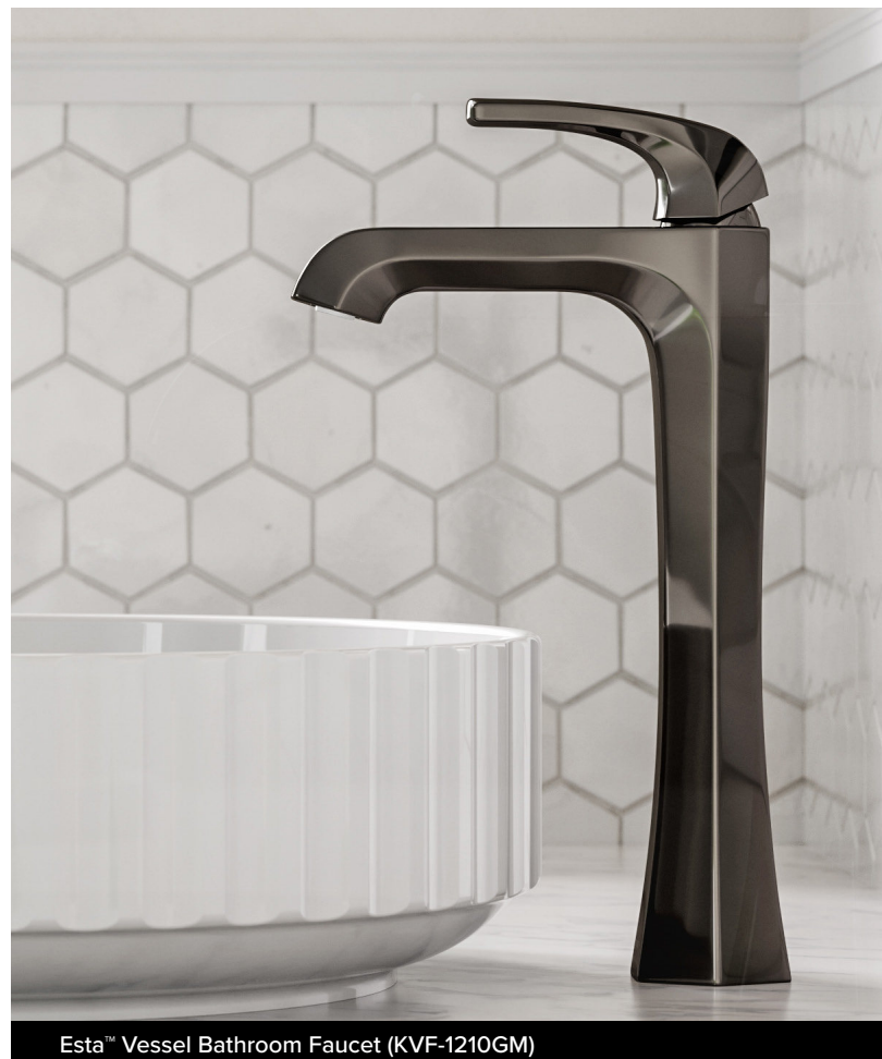
Esta™ Vessel Bathroom Faucet (KVF-1210GM)