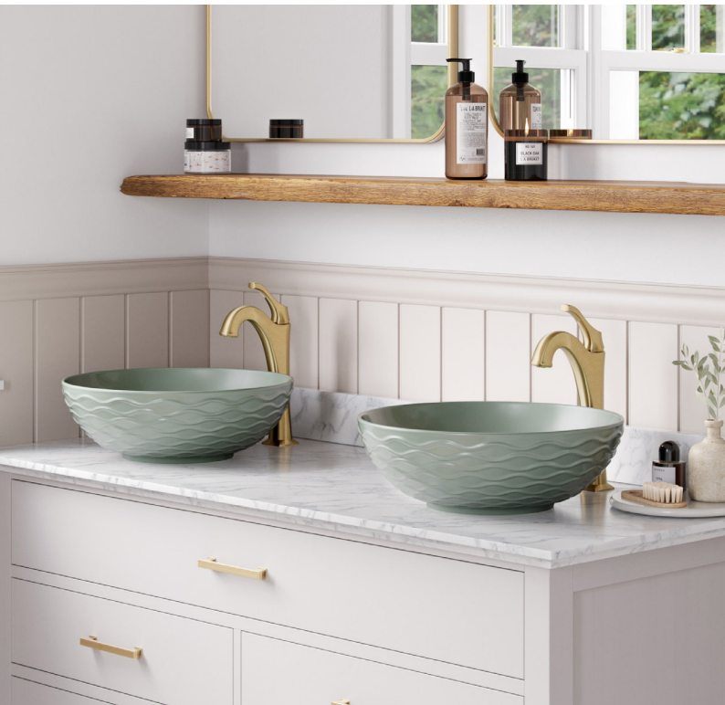
Viva™ Porcelain Ceramic Vessel Bathroom Sink (KCV-200GGR)