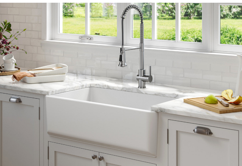
Turino™ 33" Fireclay Farmhouse Kitchen Sink (KFR1-33MWH)