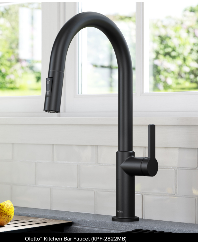
Oletto™ Kitchen Bar Faucet (KPF-2822MB)