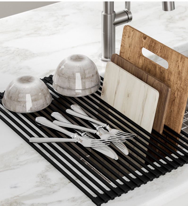
Multipurpose Over-Sink Roll-Up Dish Drying Rack (KRM-10)