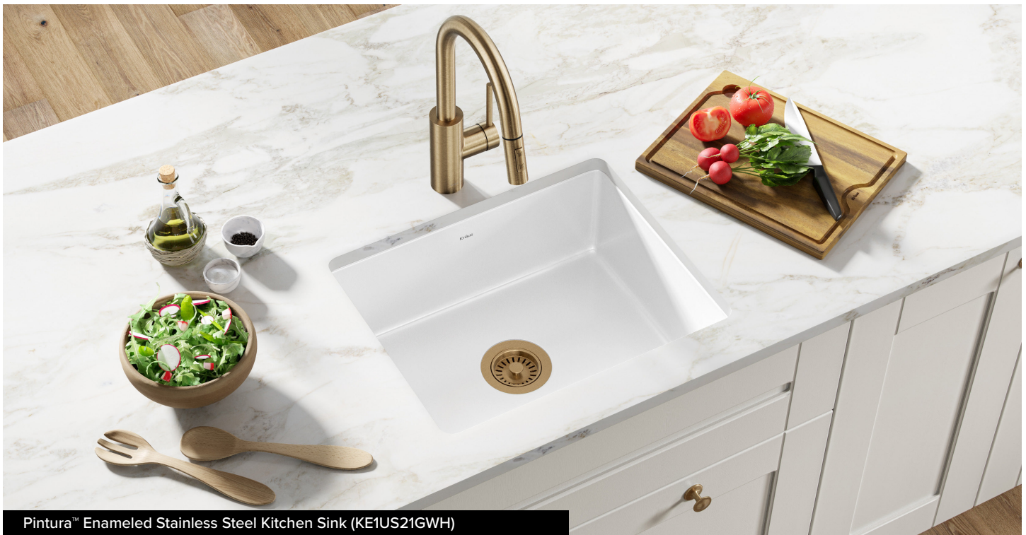
Pintura™ Enameled Stainless Steel Kitchen Sink (KE1US21GWH)