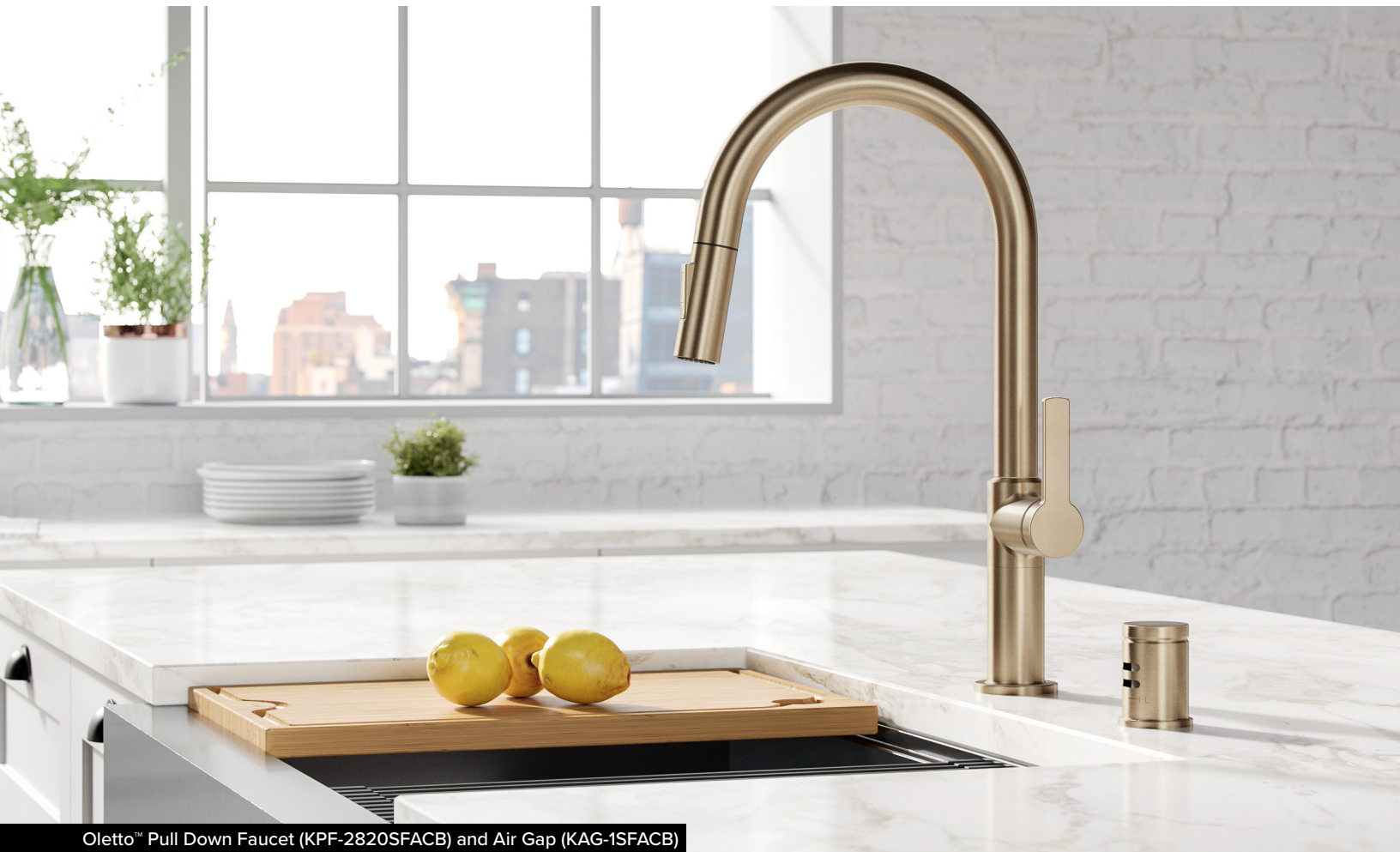
Oletto™ Pull Down Faucet (KPF-2820SFACB) and Air Gap (KAG-1SFACB)