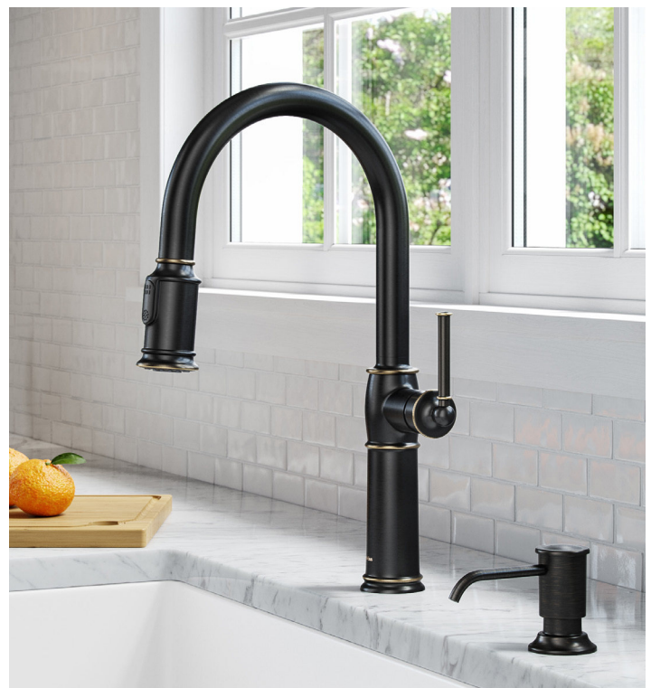
Kitchen Soap and Lotion Dispenser (KSD-80ORB)