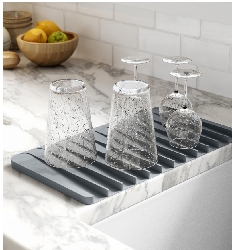
Self-Draining Silicone Dish Drying Mat (KDM-10)