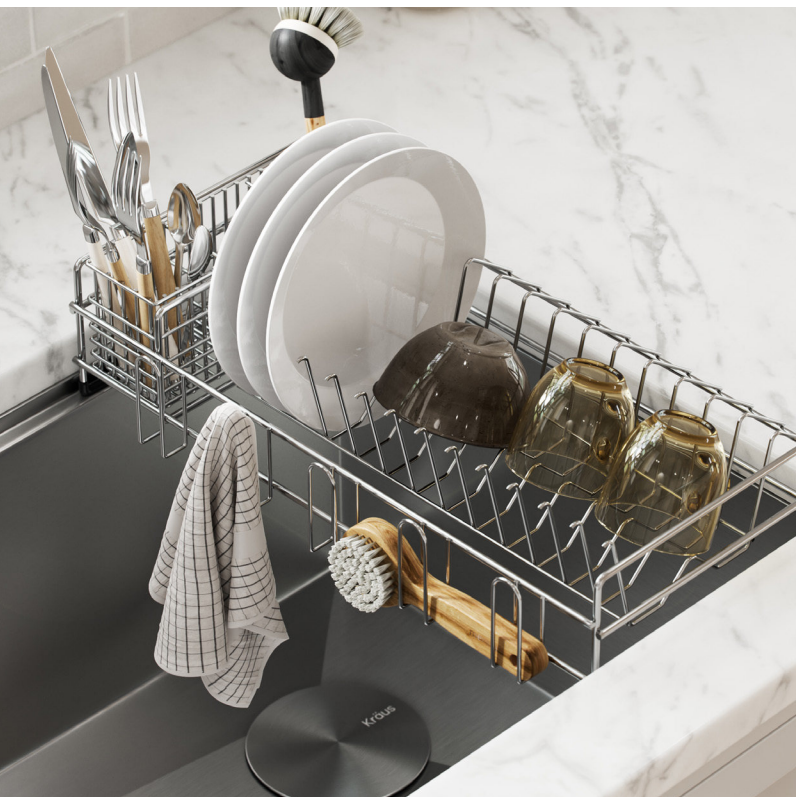
Workstation Sink Dish Drying Rack (KDR-3)