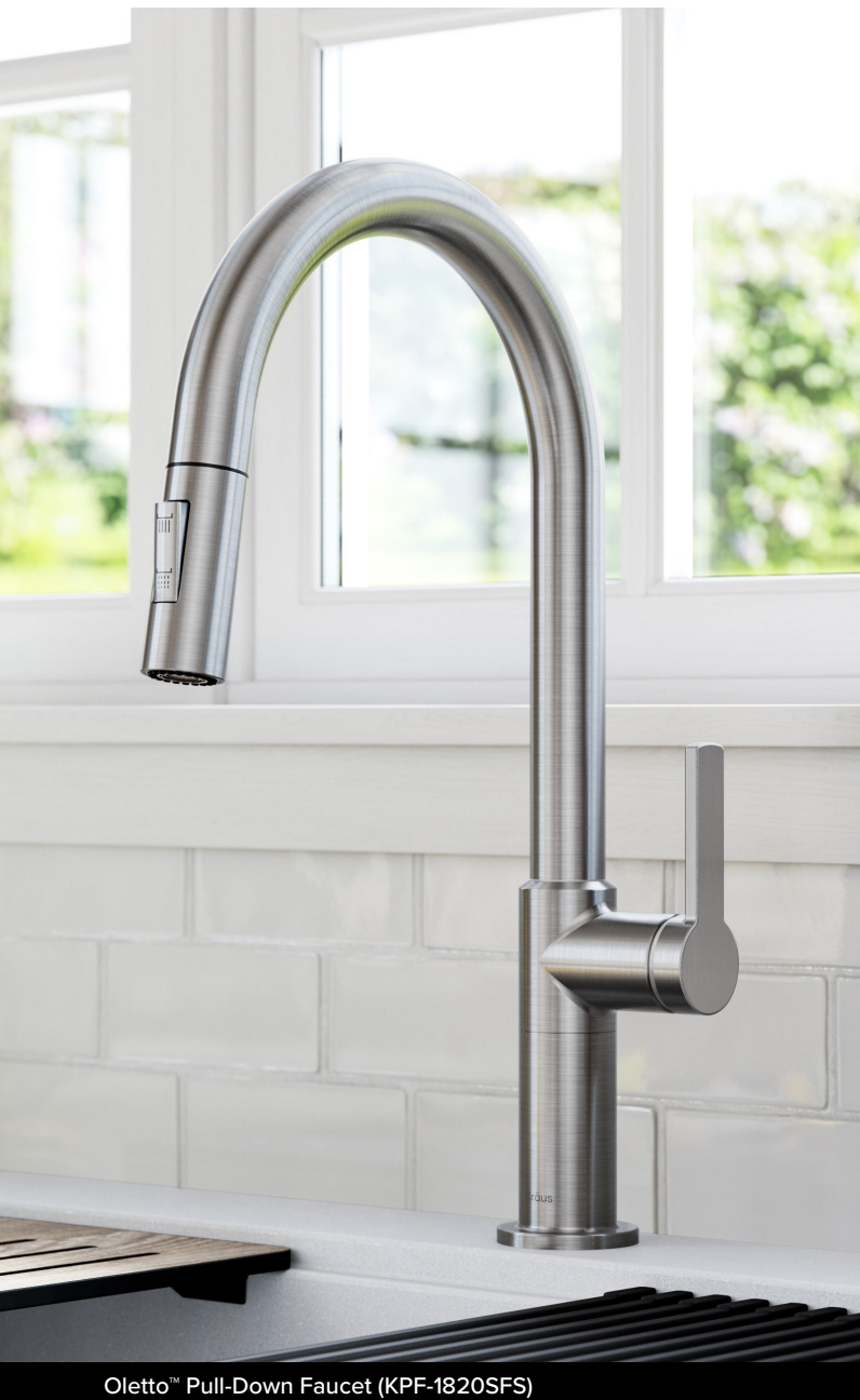
Oletto™ Pull-Down Faucet (KPF-1820SFS)

Keep your faucet looking newer longer with Spot-Free all-Brite™, a finish that requires less cleaning and shines longer by resisting water spots, fading, and fingerprints. For general maintenance of all-Brite™ faucets, we recommend cleaning your faucet with mild soap, rinsing thoroughly with warm water, and drying with a clean, soft cloth.