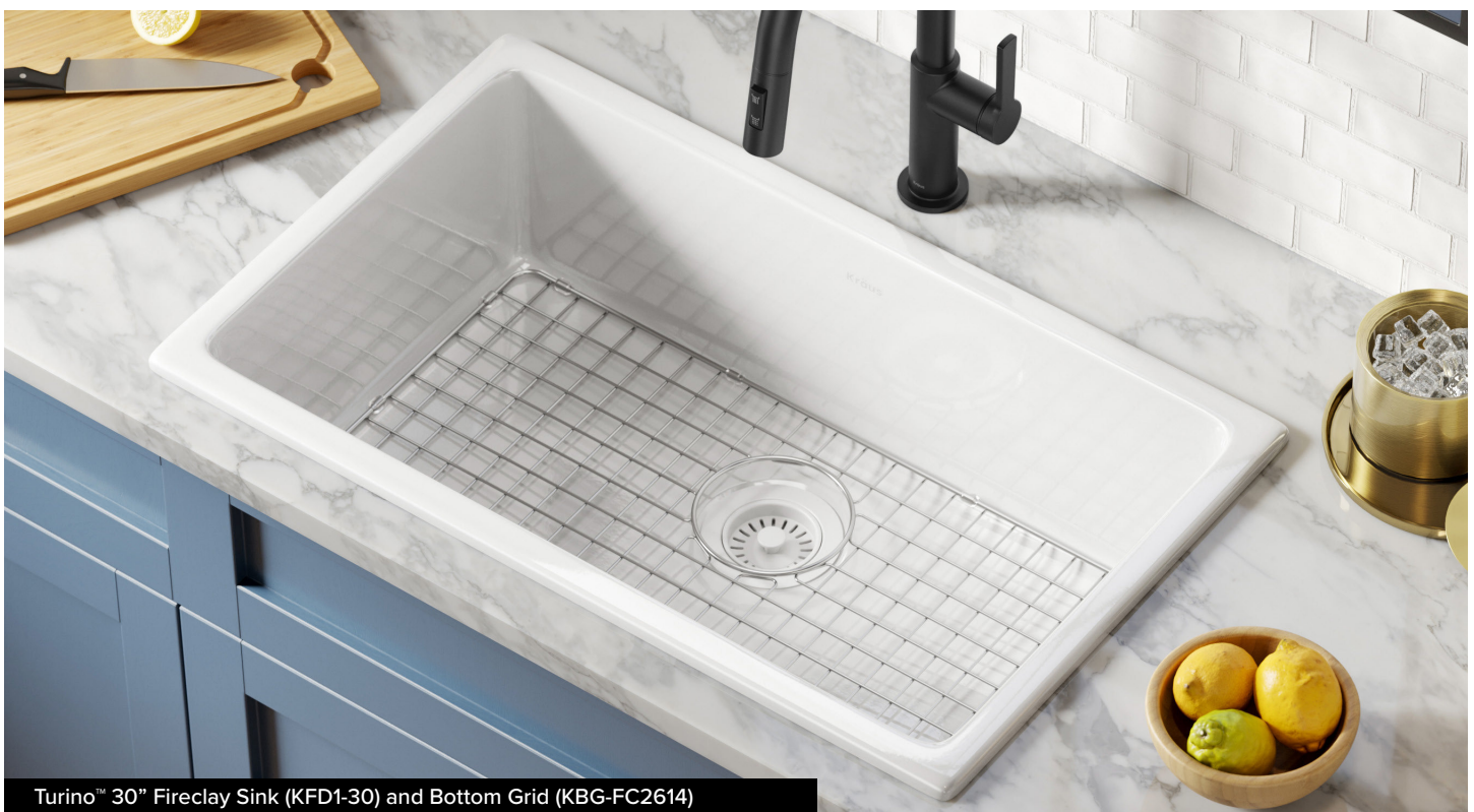
Turino™ 30" Fireclay Sink (KFD1-30) and Bottom Grid (KBG-FC2614)