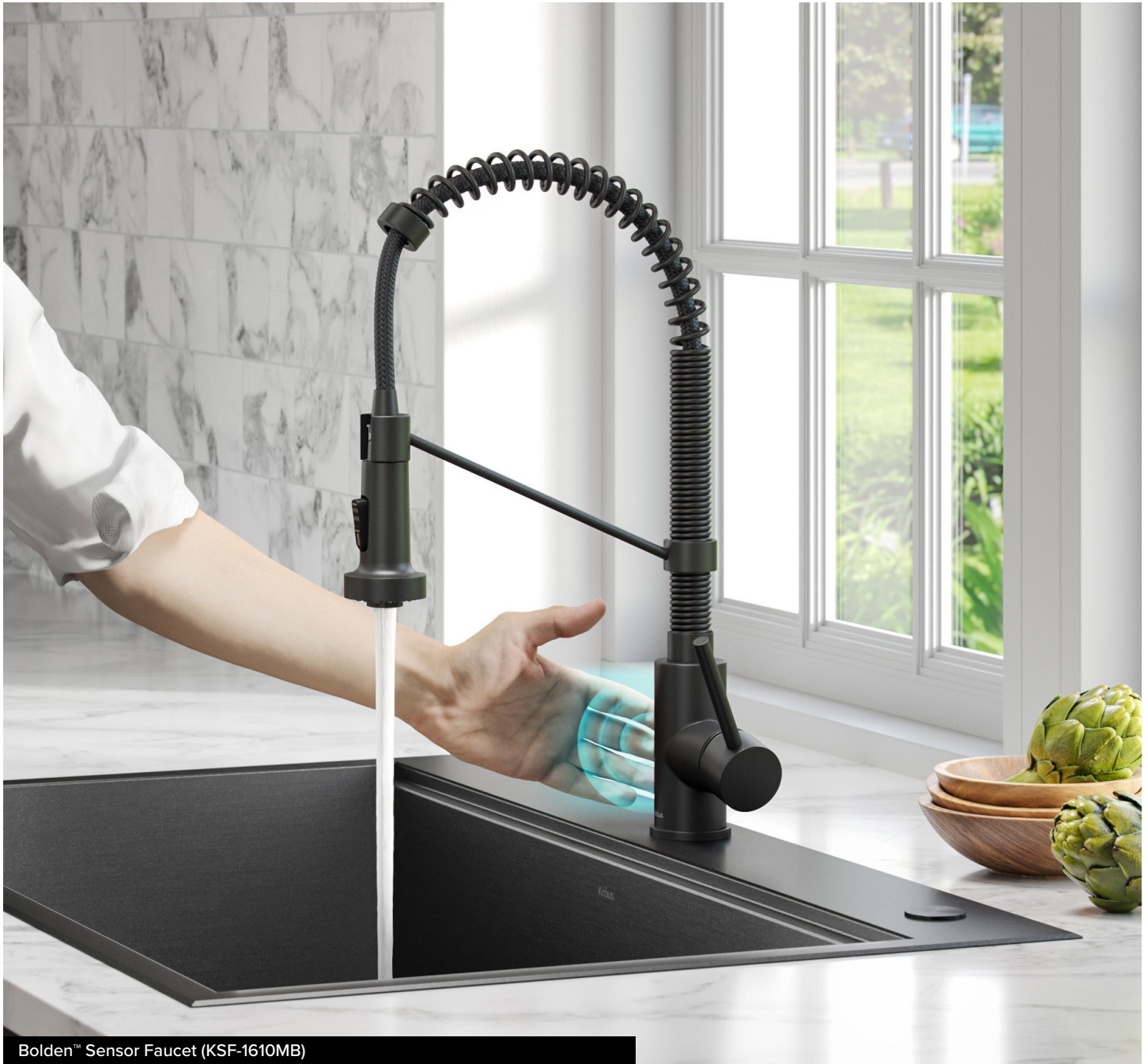
Bolden™ Sensor Faucet (KSF-1610MB)

Kraus Sensor Faucets are designed with hands-free capabilities, so they stay cleaner longer, with fewer spots and finger smudges over time. To clean and maintain your sensor faucet, simply follow the care instructions for Kraus Kitchen Faucets (Spot-Free Finishes or All Other Finishes), and enjoy the added benefit of ultra-clean hands-free functionality.