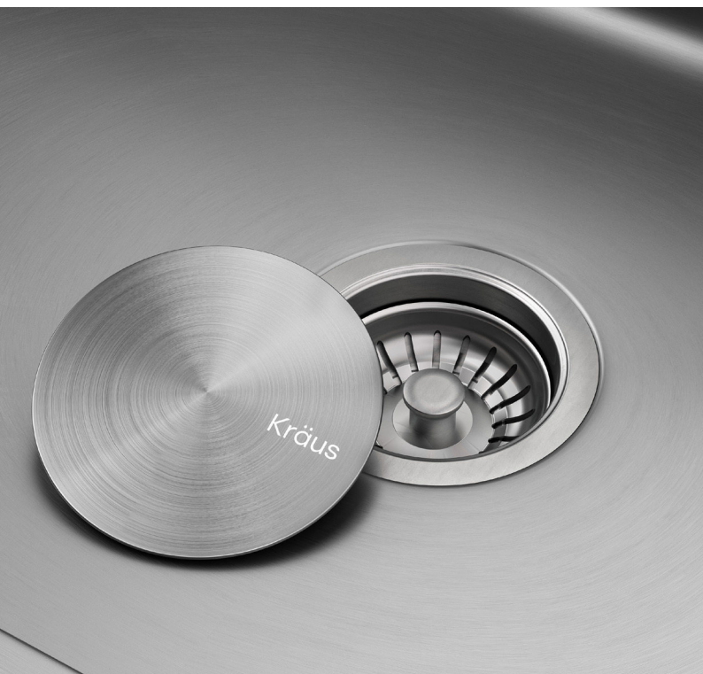
CapPro™ Removable Decorative Drain Cover (STC-2)