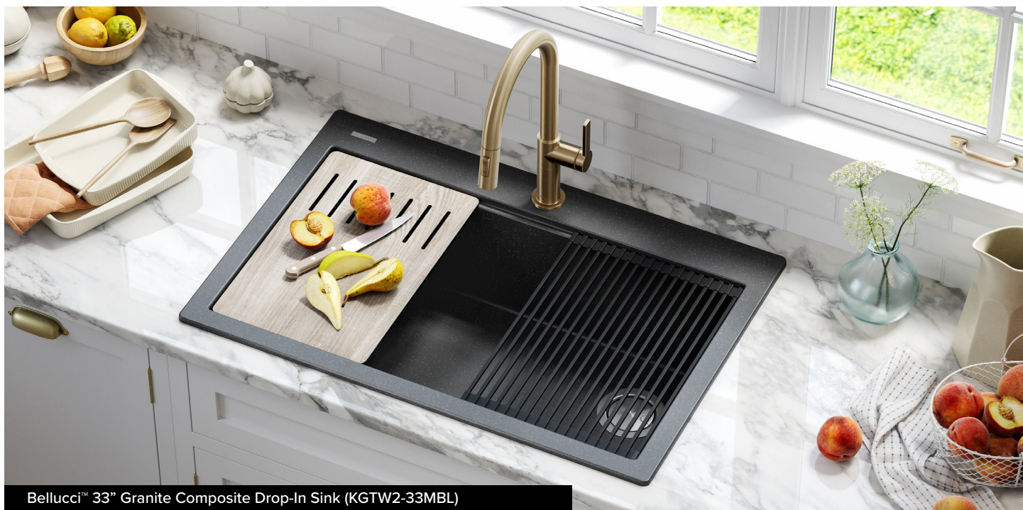
Bellucci™ 33" Granite Composite Drop-In Sink (KGTW2-33MBL)