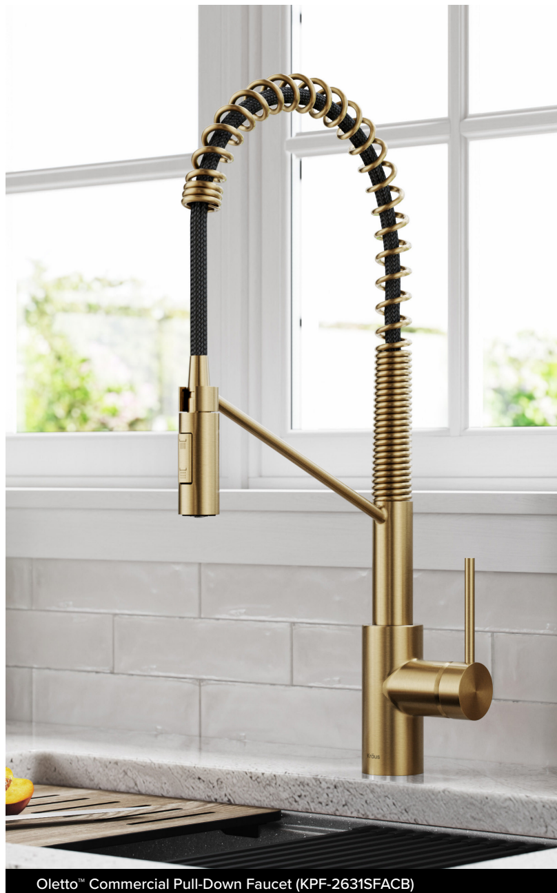
Oletto™ Commercial Pull-Down Faucet (KPF-2631SFACB)