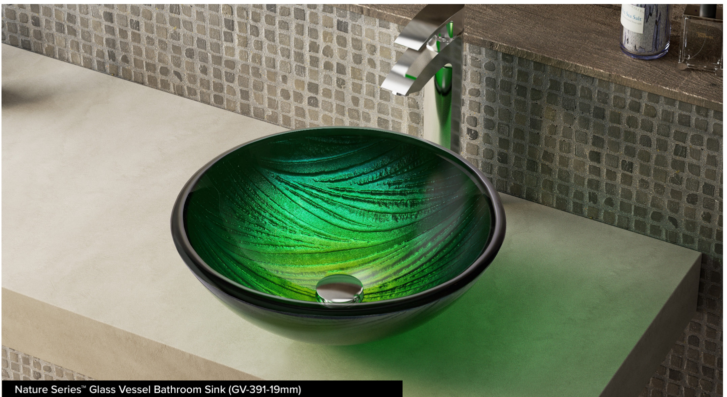
Nature Series™ Glass Vessel Bathroom Sink (GV-391-19mm)