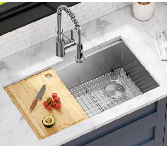
Kore™ Workstation Sink (KWU110-32)