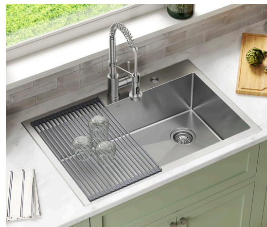
Loften™ Drop-In Sink (KHT410-33)