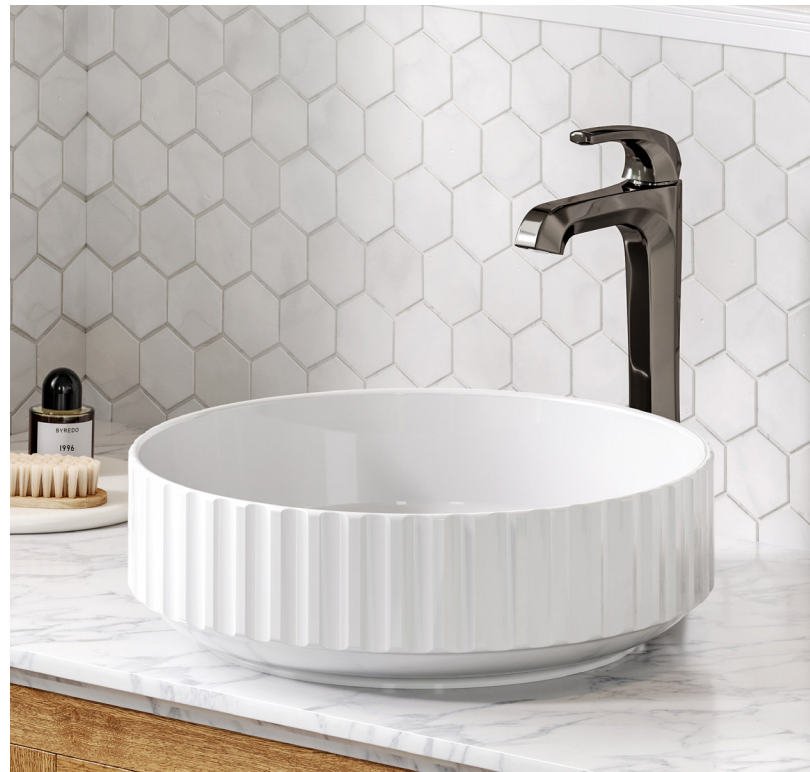
Viva™ Porcelain Ceramic Vessel Bathroom Sink (KCV-201GWH)