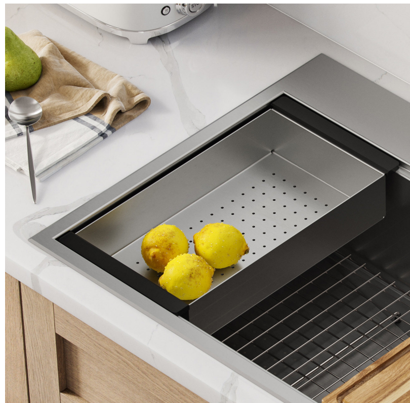
Stainless Steel Colander for Workstation Sink (CS-6)