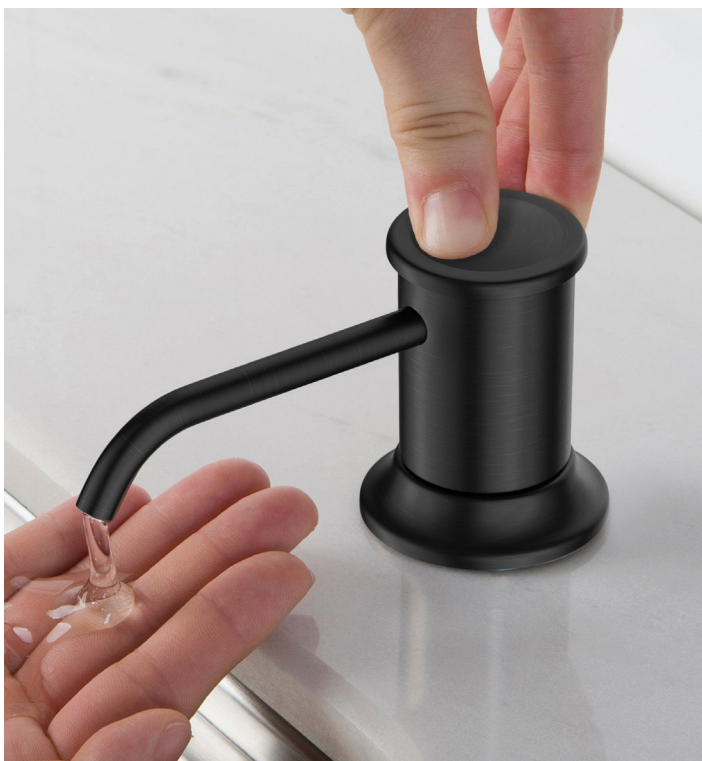
Kitchen Soap and Lotion Dispenser (KSD-80ORB)