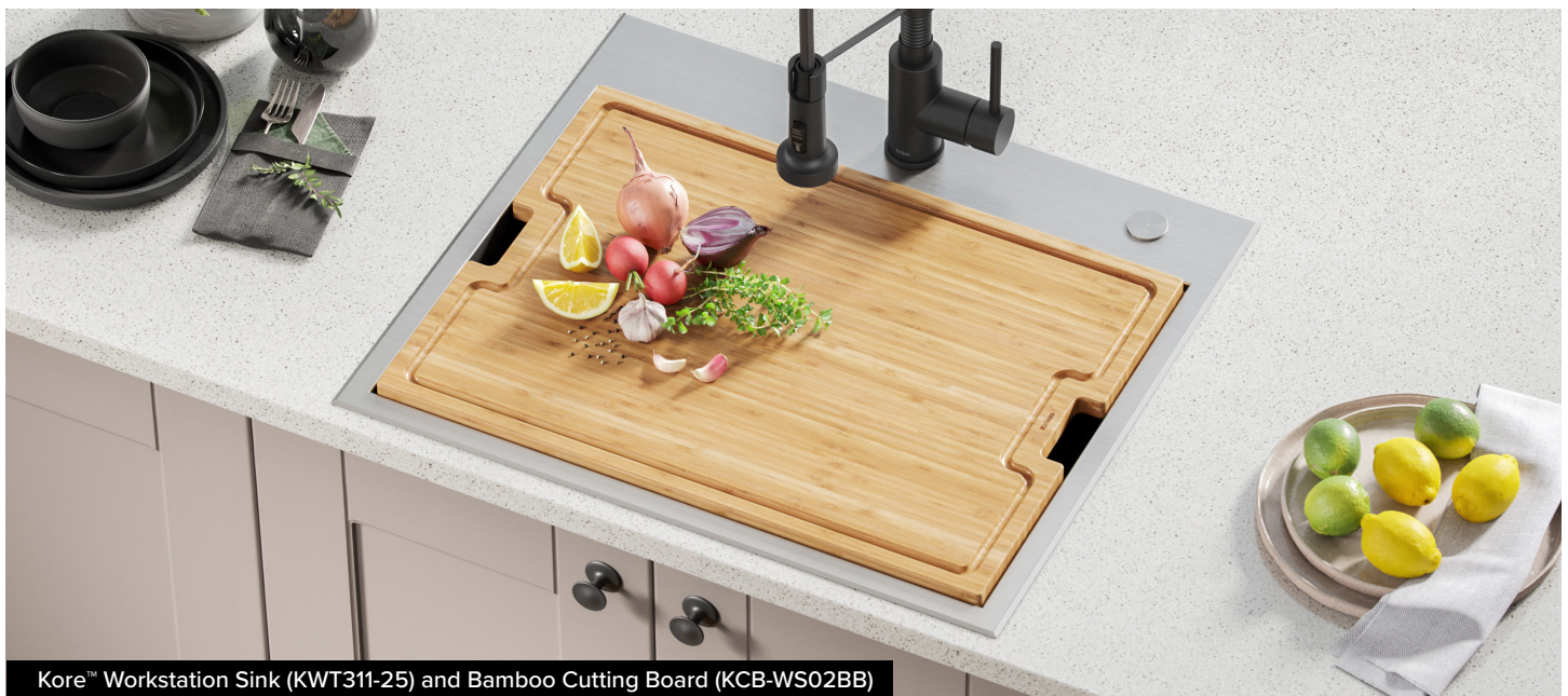
Kraus™ Workstation Sink (KWT311-25) and Bamboo Cutting Board (KCB-WS02BB)