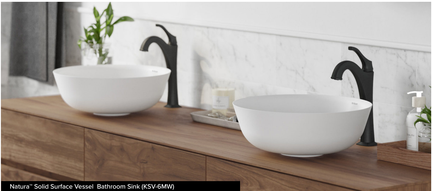
Natura™ Solid Surface Vessel Bathroom Sink (KSV-6MW)