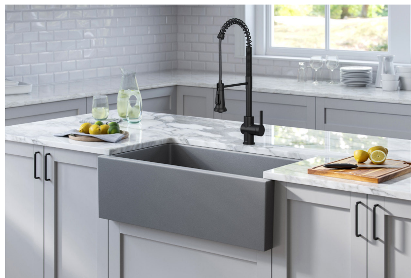
Turino™ 33" Fireclay Farmhouse Kitchen Sink (KFR1-33MGR)