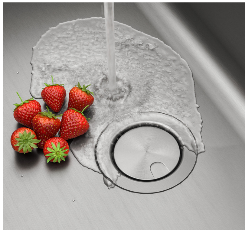
Stainless Steel Drain Assembly with Strainer (ST-4)