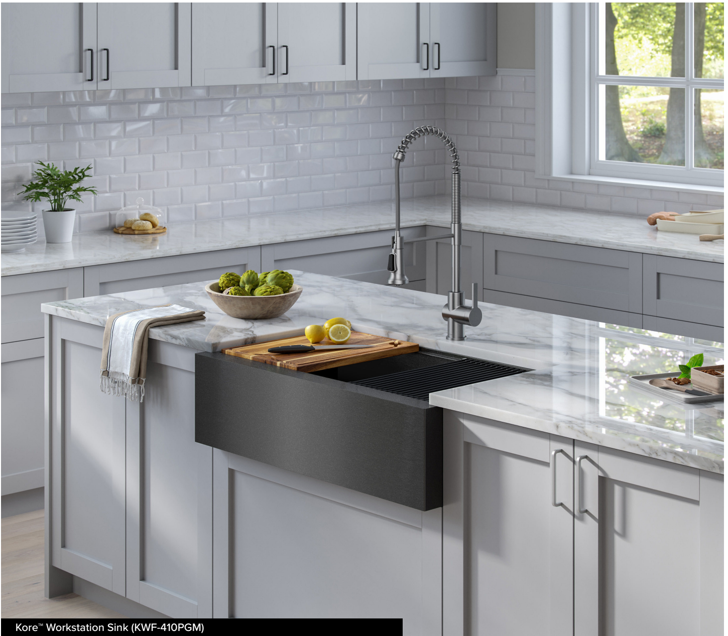
Kore™ Workstation Sink (KWF-410PGM)

Kraus PVD sinks are a showpiece in any kitchen, with a modern yet timeless appearance that is incredibly easy to maintain. Proprietary DuraShield™ finish application results in a color coating that bonds completely to the sink, resulting in unparalleled durability with superior resistance to abrasion, chips, and corrosion. The sandblasted matte texture resists water spots and fingerprints, so the sink stays cleaner longer. Maintenance is as simple as wiping down the sink surface with a microfiber cloth after use.