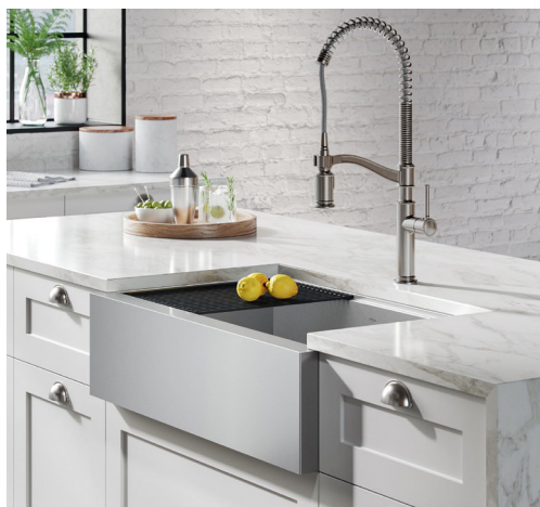
Kore™ Workstation Sink (KWF410-33)