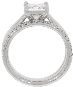
Photographs of jewelry style. Images not actual size. *Gram weights may change after final polishing or resizing.