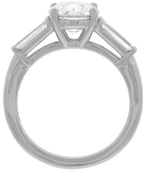
Photographs of jewelry style. Images not actual size. *Gram weights may change after final polishing or resizing.