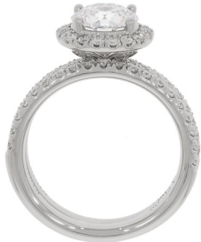
Photographs of jewelry style. Images not actual size. *Gram weights may change after final polishing or resizing.