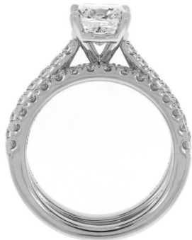
Photographs of jewelry style. Images not actual size. *Gram weights may change after final polishing or resizing.