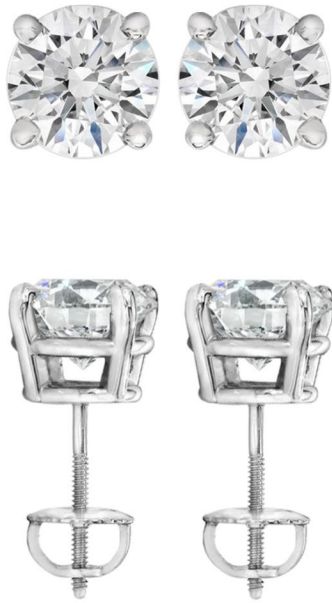
Photographs of jewelry style. Images not actual size. *Gram weights may change after final polishing.

One (1) Pair of 950 Platinum Ear Studs containing two (2) Round Brilliant Cut Diamonds weighing a total of 3.40 carats. The studs have threaded posts with screw backs and weigh a total of 3.83 grams.