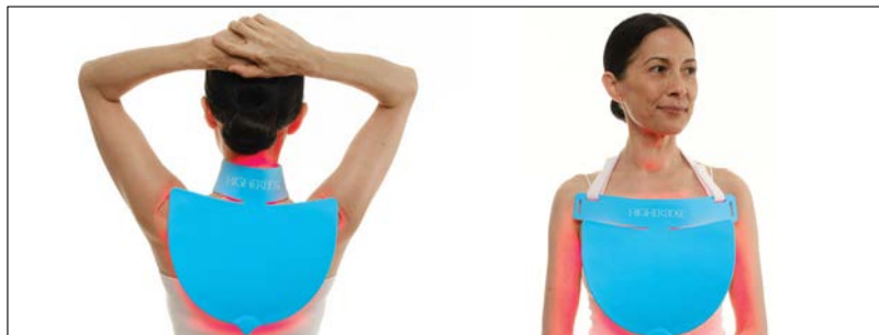
Alternative straps allow for full chest area coverage