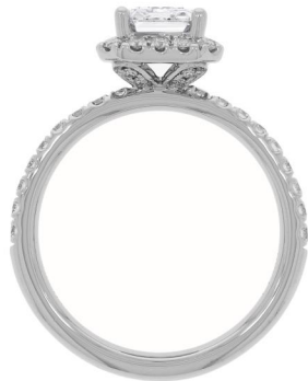
Photographs of jewelry style. Images not actual size. *Gram weights may change after final polishing or resizing.