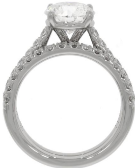
Photographs of jewelry style. Images not actual size. *Gram weights may change after final polishing or resizing.