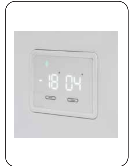
Ease-Access Temperature Controls