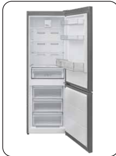
4 Glass Shelves 4 Clear Drawers: 1 Fridge Drawer, 3 Freezer Drawers