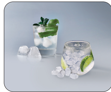
Dual Ice Maker with Ice Bites™