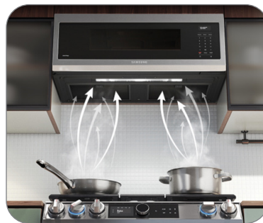
550 CFM Hood Ventilation

Fingerprint Resistant Black Stainless Steel