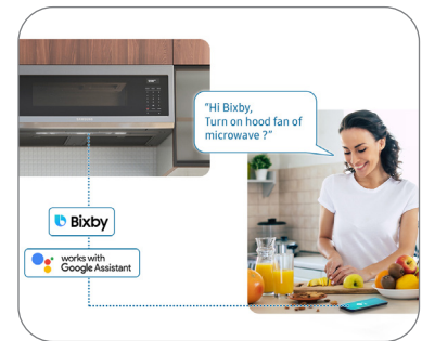
Wi-Fi and Voice Control