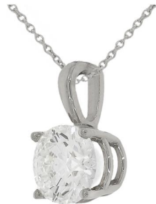
Photographs of jewelry style. Images not actual size. *Gram weights may change after final polishing or resizing.