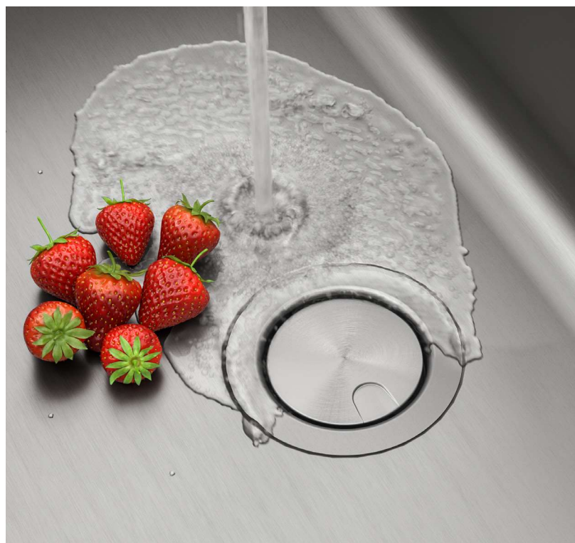
Stainless Steel Drain Assembly with Strainer (ST-4)