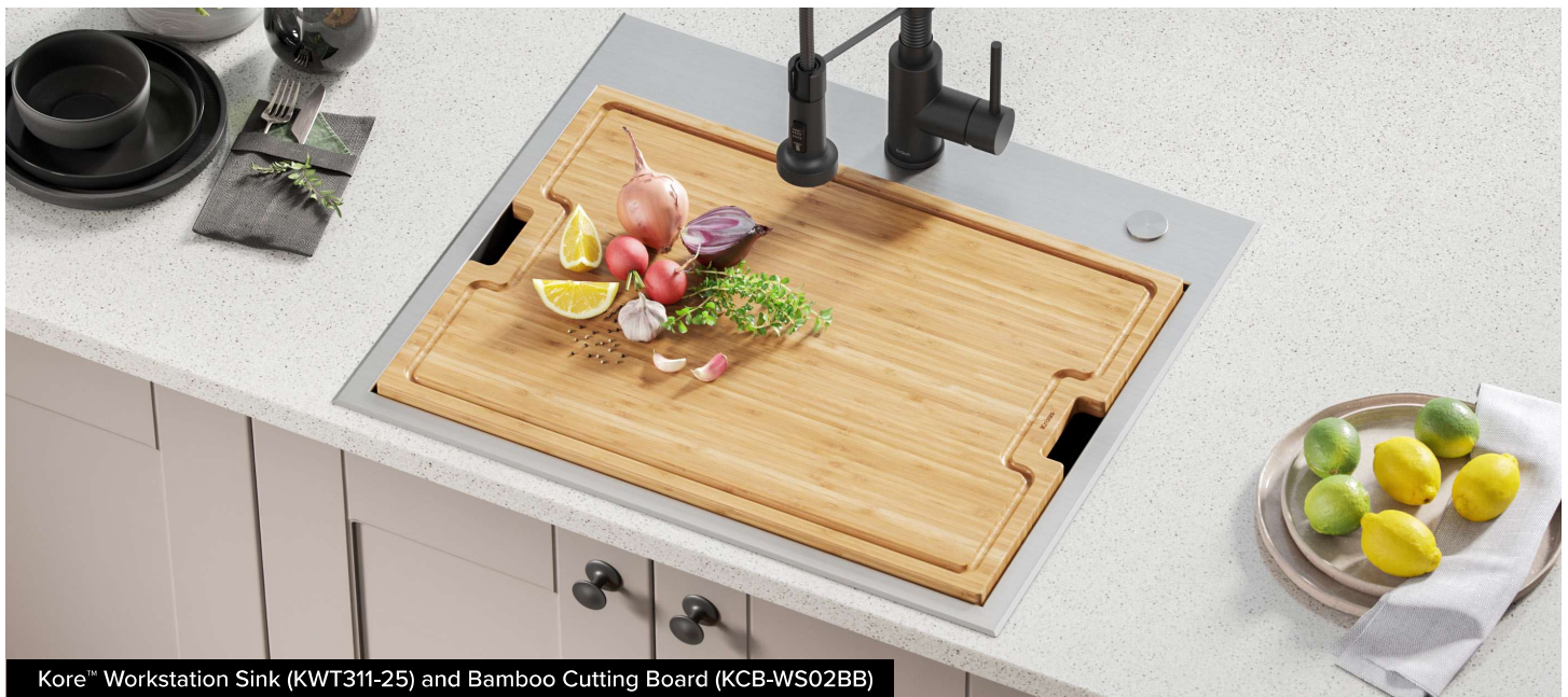
Kraus™ Workstation Sink (KWT311-25) and Bamboo Cutting Board (KCB-WS02BB)