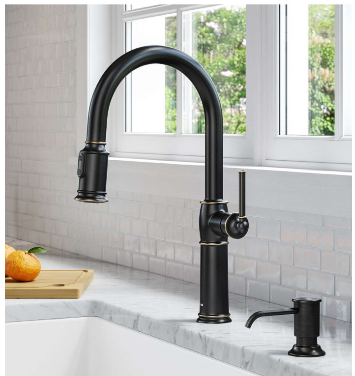
Kitchen Soap and Lotion Dispenser (KSD-80ORB)