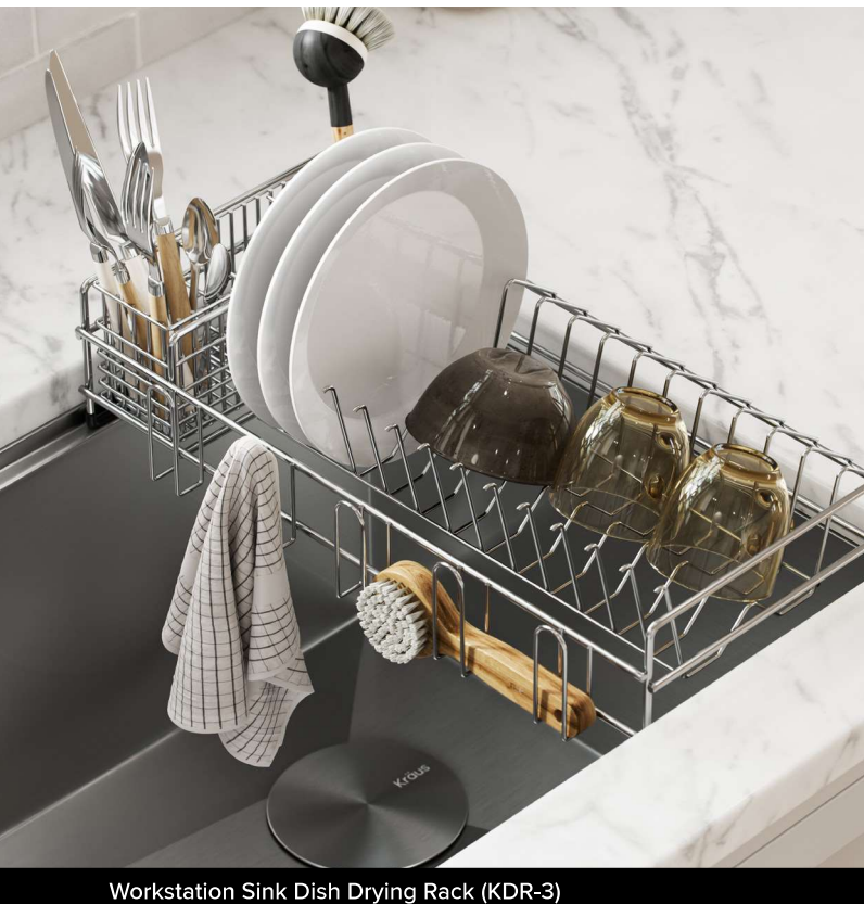
Workstation Sink Dish Drying Rack (KDR-3)