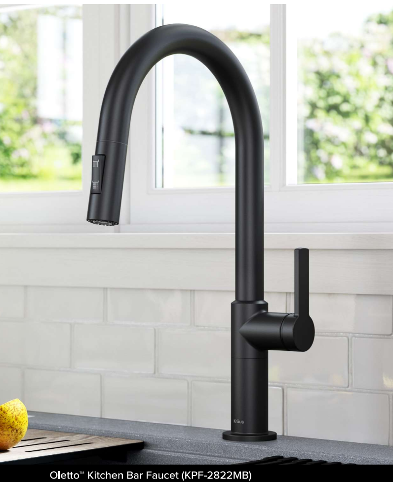
Oletto™ Kitchen Bar Faucet (KPF-2822MB)