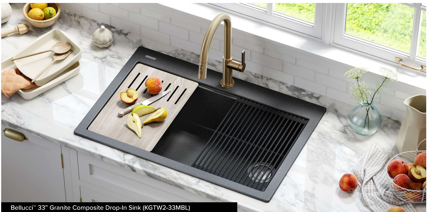
Bellucci™ 33" Granite Composite Drop-In Sink (KGTW2-33MBL)