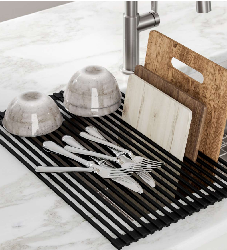
Multipurpose Over-Sink Roll-Up Dish Drying Rack (KRM-10)