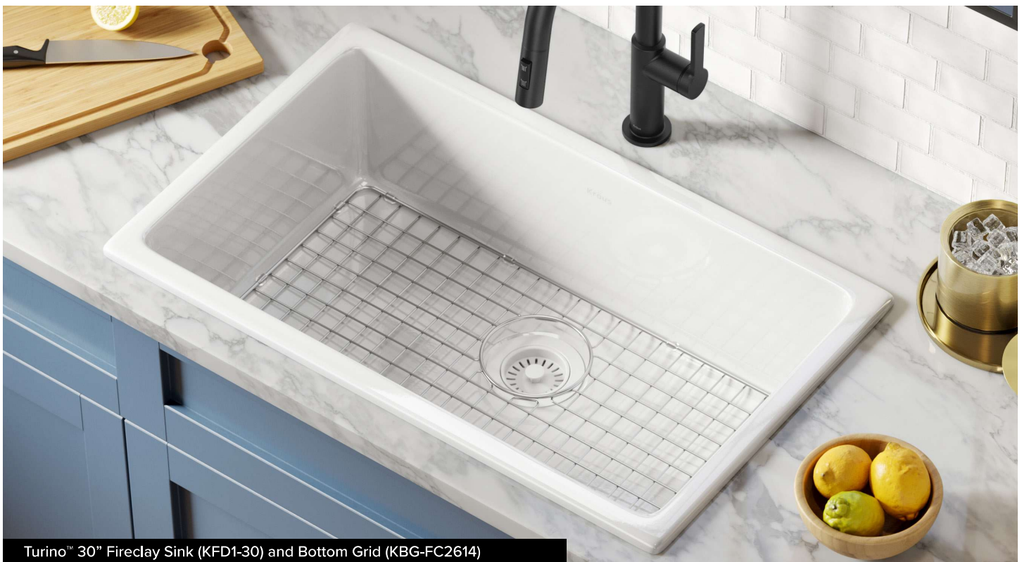
Turino™ 30" Fireclay Sink (KFD1-30) and Bottom Grid (KBG-FC2614)