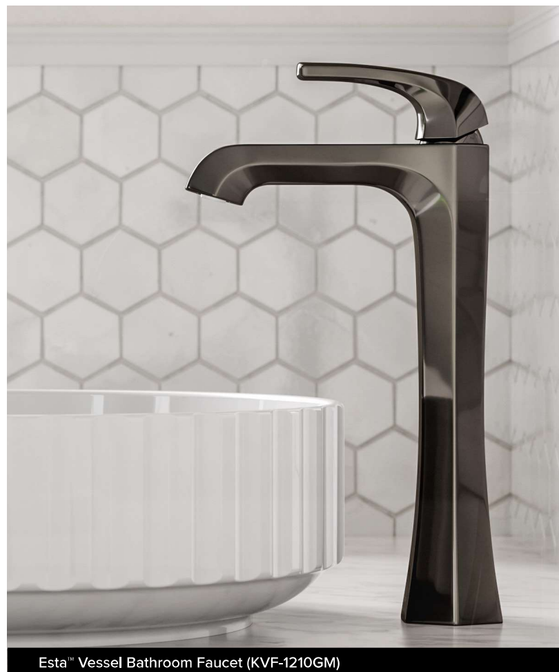
Esta™ Vessel Bathroom Faucet (KVF-1210GM)