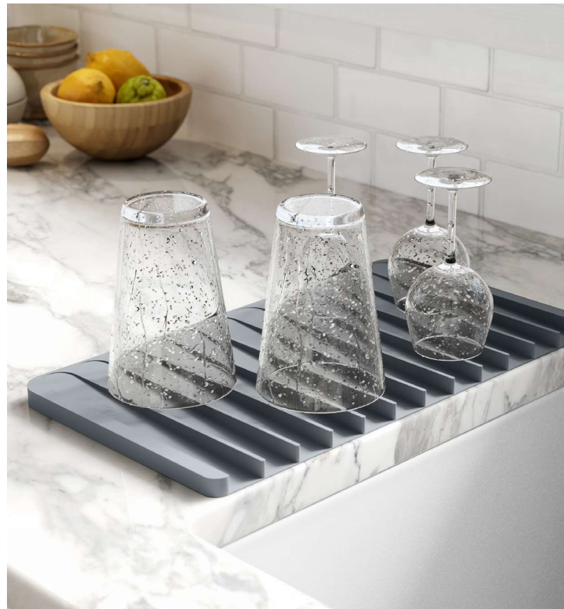
Self-Draining Silicone Dish Drying Mat (KDM-10)