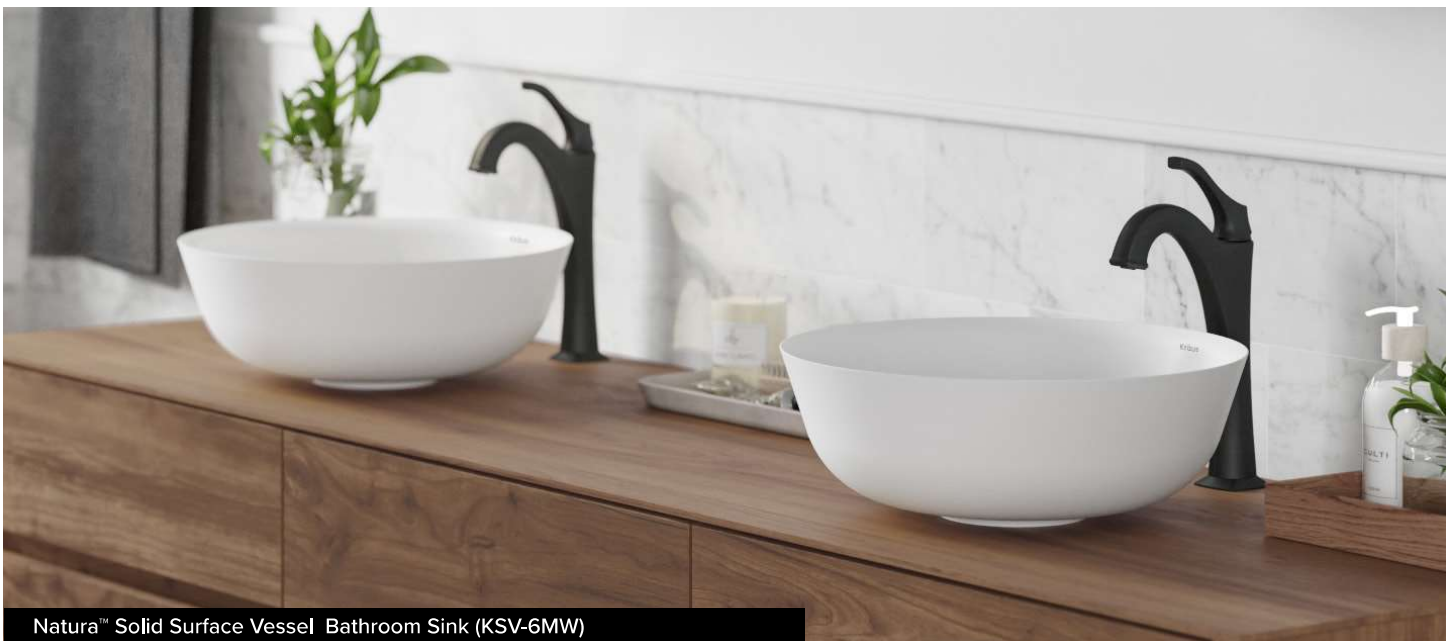
Natura™ Solid Surface Vessel Bathroom Sink (KSV-6MW)