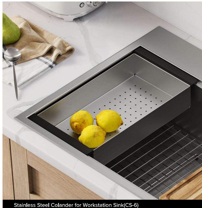
Stainless Steel Colander for Workstation Sink (CS-6)