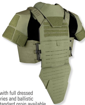
Shown with full dressed accessories and ballistic groin. Standard groin available.

The Shift 360 System is a sleek and innovative plate rack design that offers the operator ultimate scalability based on mission-specific requirements.