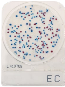
E. coli and Coliforms Cat. no. 54082