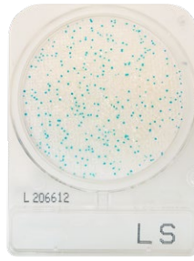
Listeria Cat. no. LS100