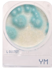
Yeast and Mold Cat. no. 54083