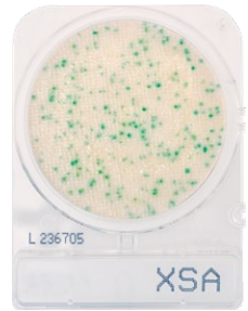
Staphylococcus aureus Cat. no. 54086

Simplify data storage, sample entry, and reporting with the accessories below.