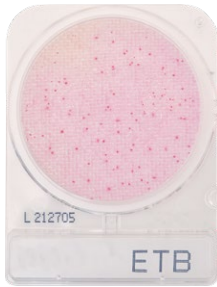
Enterobacteriaceae Cat. no. ETB100