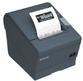
Thermal Printer Includes USB Connector and power supply. Cat. no. 120101