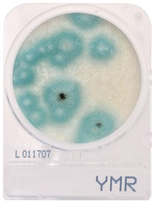
Yeast and Mold Rapid Cat. no. 54084