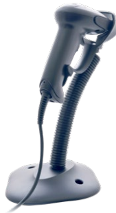
Barcode Scanner Includes USB Connector and stand. Cat. no. 120102