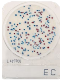
E. coli and Coliforms