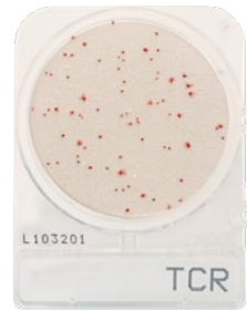
Total Count Rapid