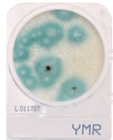
Yeast and Mold Rapid