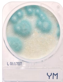
Yeast and Mold