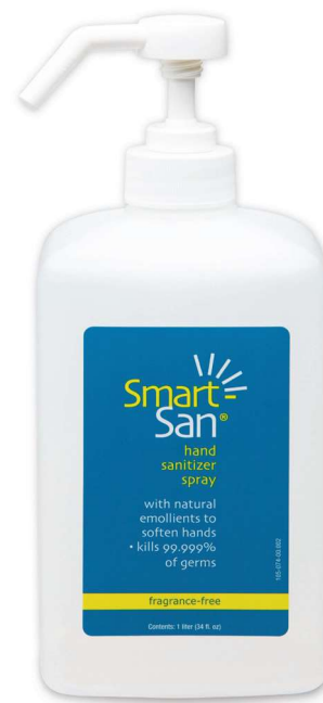
1000mL Countertop Pump Bottle SMA0016U