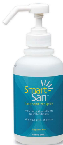
500mL Countertop Pump Bottle SMA0015U