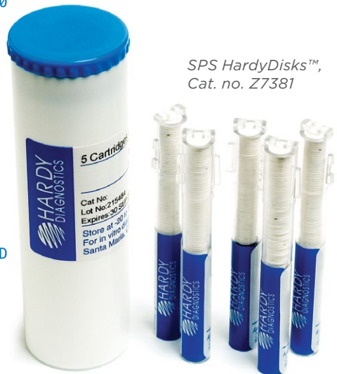
SPS HardyDisks™, Cat. no. Z7381