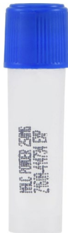
TB Prep Kit™ , Cat. no. Z160

Potassium hydroxide (KOH) 40%, for VP test. Compatible with strip, or cupule tests. 15ml, each ..... Z92