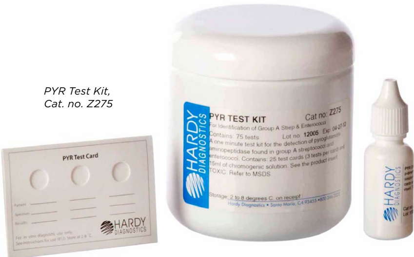
PYR Test Kit, Cat. no. Z275

For the rapid identification of the Streptococcus anginosus group (formerly Streptococcus milleri ) by detection of arginine decarboxylase activity and the production of acetoin (MRVP). 10 tests/kit .....Z14