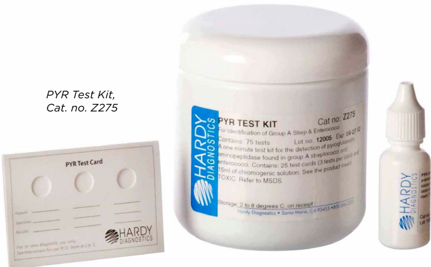
PYR Test Kit, Cat. no. Z275

For the rapid identification of the Streptococcus anginosus group (formerly Streptococcus milleri ) by detection of arginine decarboxylase activity and the production of acetoin (MRVP). 10 tests/kit .....Z14