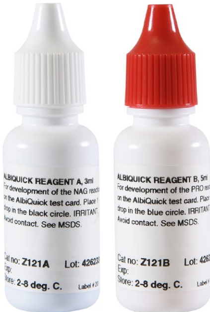
AlbiQuick™, Cat. no. Z121

A permanent mounting fluid and preservative that contains the stain lactophenol cotton blue. 15ml, each.....Z137