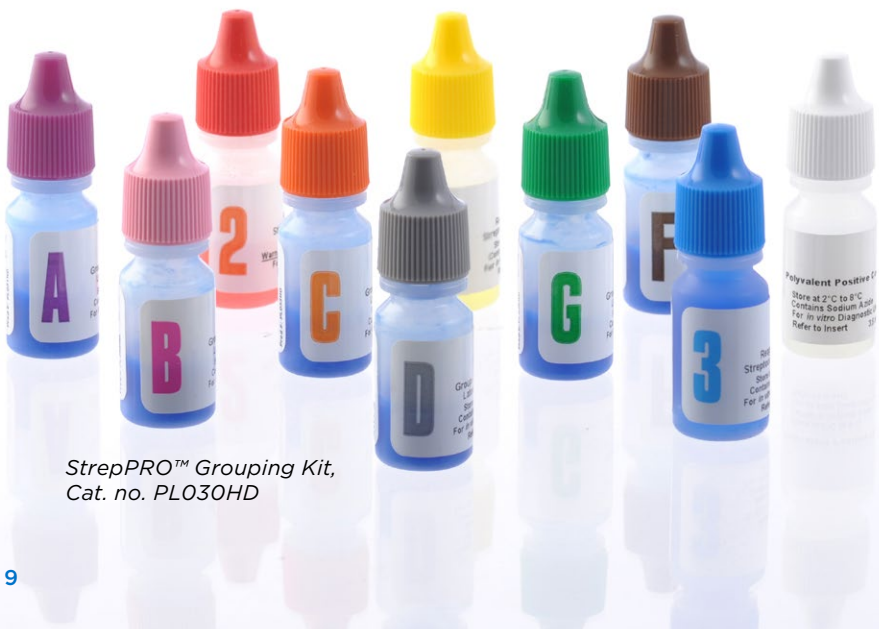
StrepPRO™ Grouping Kit, Cat. no. PLO30HD

For the differentiation of anaerobic bacteria based on susceptibility to vancomycin. 50 disks/cartridge .....Z7501