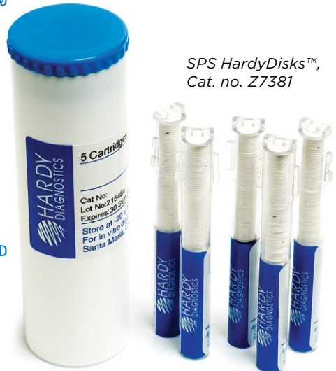
SPS HardyDisks™, Cat. no. Z7381