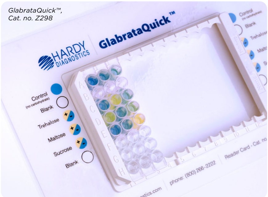
GlabrataQuick™ , Cat. no. Z298