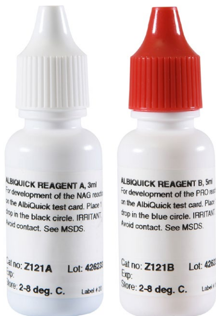
AlbiQuick™ , Cat. no. Z121

A permanent mounting fluid and preservative that contains the stain lactophenol cotton blue. 15ml, each..... Z137