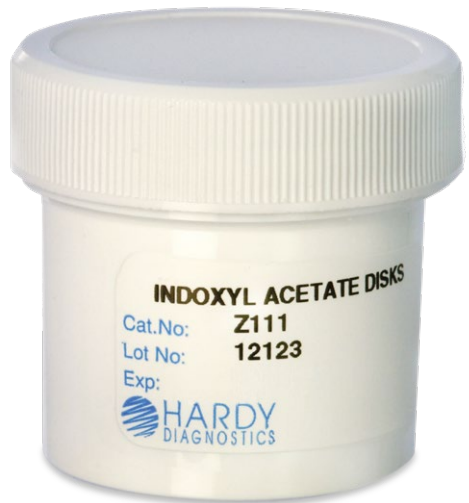
Indoxyl Acetate, HardyDisk™, Cat. no. Z111