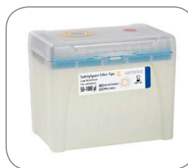
Single Tray racks purity-certified tip racks