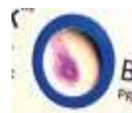
Positive reaction for PRO, visual read-out