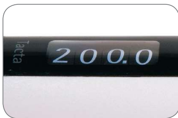
The volume is easy to read even when the pipette is angled.

The large, easy-to-read display helps you to see all four digits of the set volume from a distance without straining your eyes. The volume is easy to read even when the pipette is angled – eliminating the need to turn your head into an uncomfortable position.