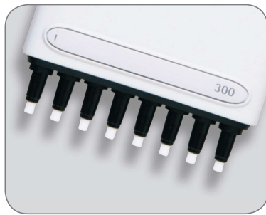
Safe-Cone Filters protect the pipette from contamination.

The exchangeable Safe-Cone Filters, used in pipette tip cones, act as barriers to prevent sample aerosols and fluids from contaminating the internal components of the pipette.