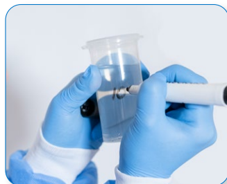
Convenient Write-on area