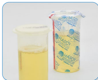
Easy-to-remove, shrink wrap

Heavy duty - Vials are made of sturdy polypropylene with a leak-resistant seal that holds up even during air transport.