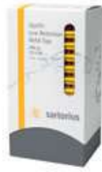
Refill Tower (10x96 tips)