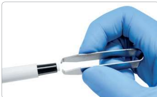
Removing the Safe-Cone Filter

For general applications. These filters can be used for the same applications as the Plus filter, but need to be changed more frequently.