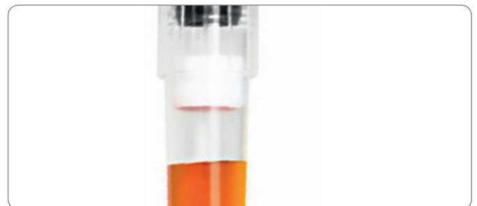
SafetySpace – the additional space between the sample and filter.