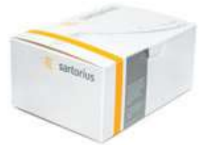
Bulk in a Box