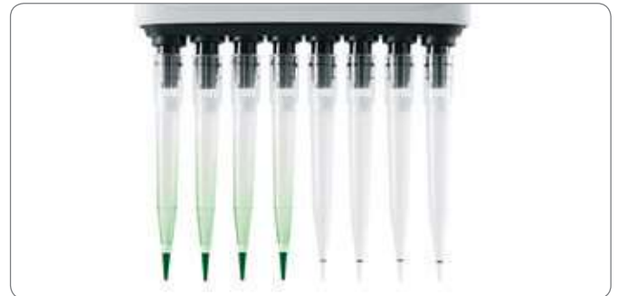
The four Low Retention Tips on the right retain only minimum residual liquid.