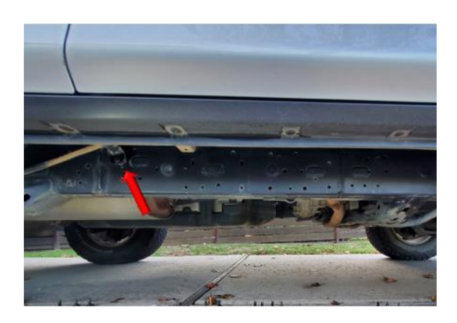
Step 2. Position the slider onto the vehicle frame and begin loosely installing the supplied hardware. Be sure to reattach the parking brake bracket. Once all the hardware is installed go ahead and tighten the bolts down.

Step 1. Starting on the passenger side. Clean the frame of dirt and debris, then use a 12mm Socket to remove the emergency brake line bracket.