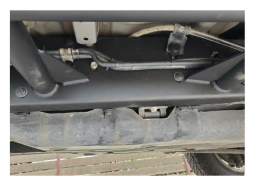
Step 12. Tighten all the hardware

Step 11. Attach the 13mm bolts, flat washers, and lock washers loosely to the remaining holes, then reinstall the KDSS lines, parking brake lines, and gas tank skid.