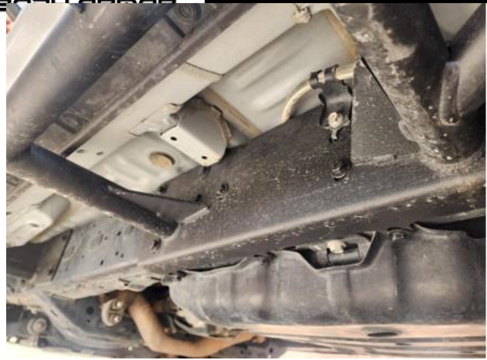
Step 6. Go back over all the hardware to ensure proper tightness on both driver and passenger side.