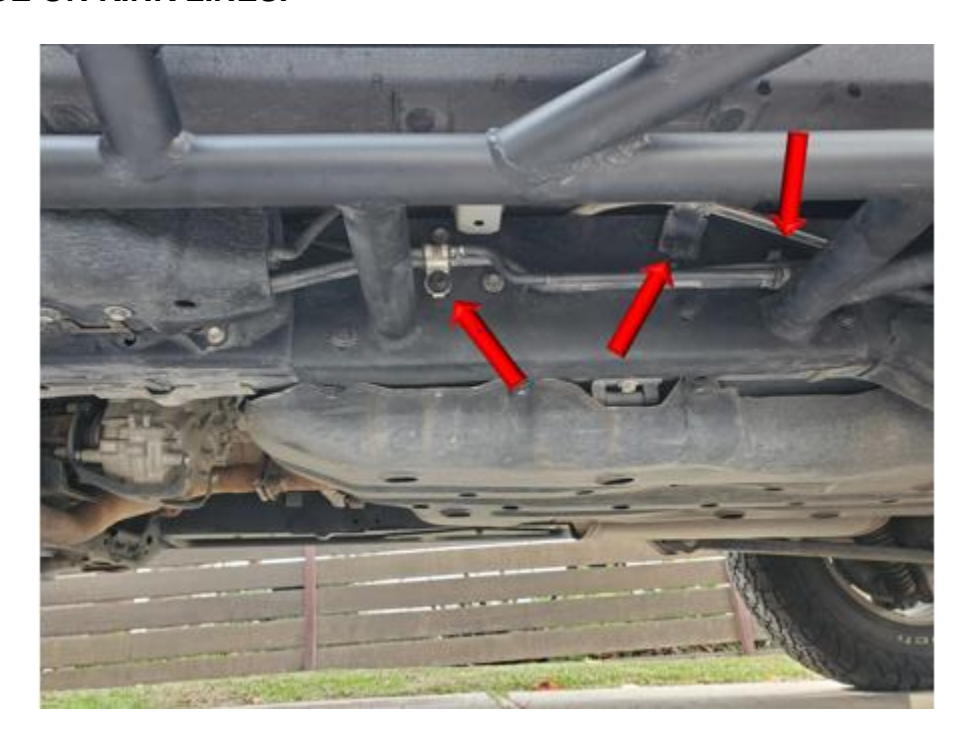
Step 4. Remove the 3 12mm bolts holding the gas tank skid plate

Step 3. Remove the parking brake bracket and the 2 KDSS brackets using a 12mm socket. NOTE: BE CAREFUL WHEN MANIPULATING THE KDSS LINES. EXCESSIVE MANIPULATION COULD DAMAGE OR KINK LINES.