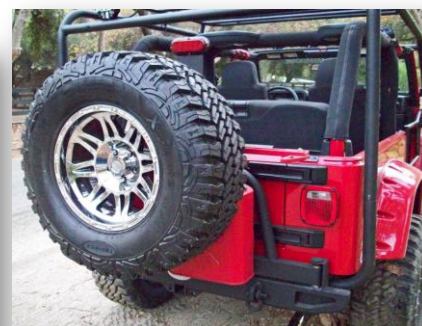
New Trail Doors