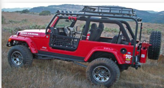
New Roof Rack Cargo System on TJL