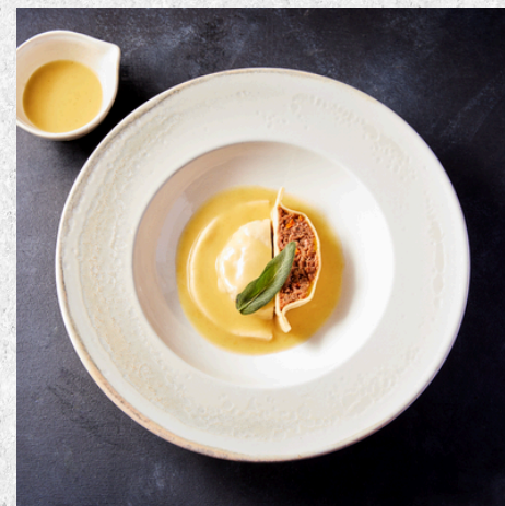
Ravioli with lamb kabab