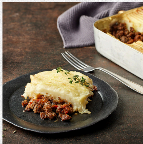
New-Meat Shepherds Pie