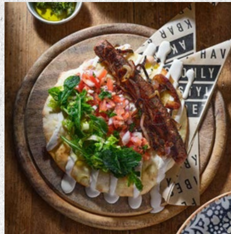
Redefine New-meat Souvlaki