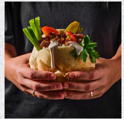
Redefine Lamb in a Pita Bread