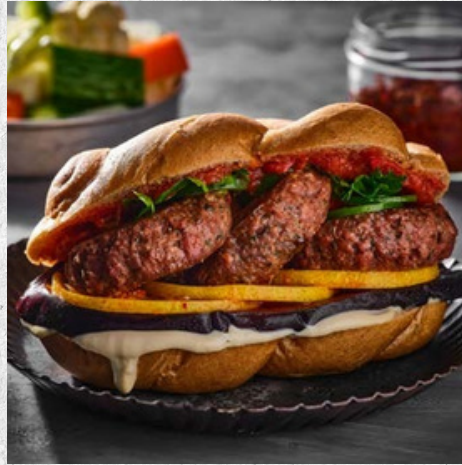
Redefine Kabab in a Challah Roll