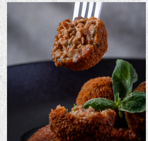
Redefine Fried Lamb Meatballs

Visit our recipe page for inspiration and share your creations with us on social media @redefinemeat