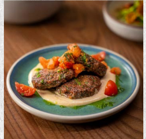
Redefine Lamb Keftedes