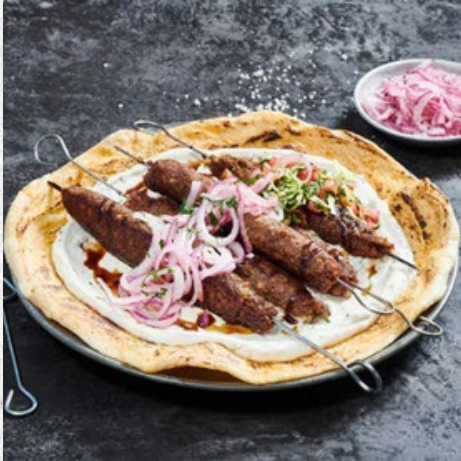
Redefine Kabab on Skillet Flatbread