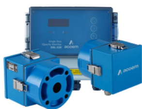
DSL-2XX SERIES (220, 230 & 240)

Engineered for accuracy and performance, our instruments are reliable and expertly manufactured using robust 316 stainless steel. All feature a latched head & lid design for easy installation and maintenance access with no moving parts to reduce maintenance requirements. Acoem Dynoptic monitors have become the industry standard for several large Acoem customers around the world.