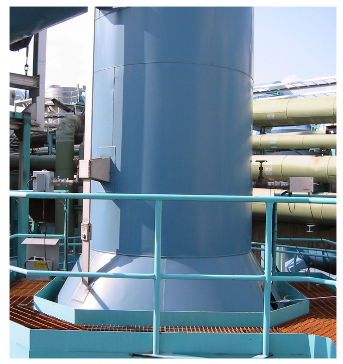
A cross-stack installation, showing the emitter and receiver

The Opsis system is approved according to EN 15267 by TÜV and MCERTS. The system meets and exceeds requirements from international organizations such as U.S. EPA and Chinese EPA.