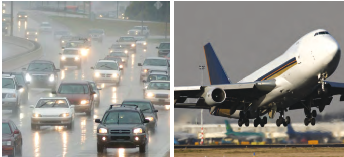
Suitable for a range of applications.

Airports need to monitor visibility across the airfield to ensure the safety of taxiing aircraft, for Runway Visual Range (RVR) calculation and for transmission to aircraft as part of the METAR. The SWS-200 can fulfil all of these roles and also provides present weather information for inclusion in METAR reports.