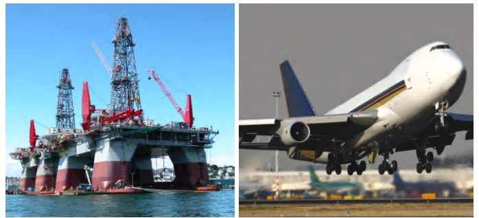
Suitable for a range of applications.

In offshore and general aviation, the costs of servicing or replacing a sensor can be significant. When the equipment is installed offshore access is difficult and expensive, whilst for any aviation use there are significant costs due to restrictions imposed when equipment is not operational. Many VPF series installations are in the most extreme of environments where they have a reputation for reliability and long life. The operational life of the VPF sensor in such environments is frequently in excess of 10 years.