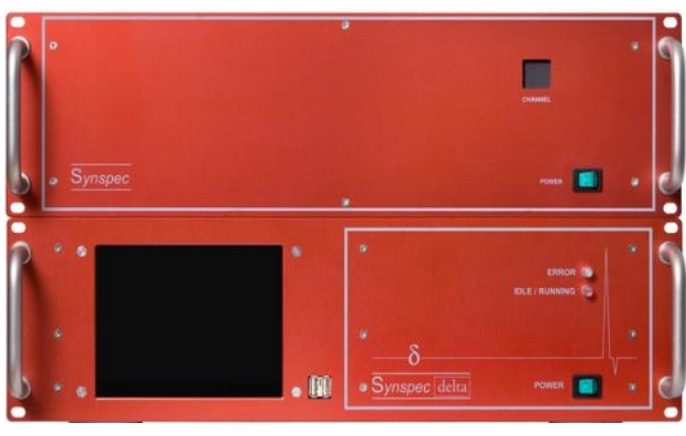
Delta analyzer in combination with a multi channel selector