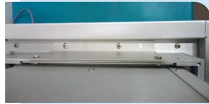
Figure 5. Attach Securing Bracket with M4 x 8 mm screws