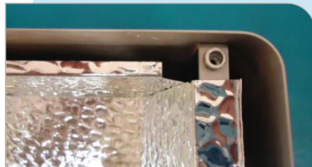
Figure 2. Install Spacers