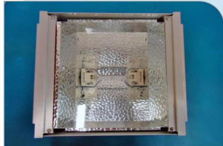
Figure 3. Install Lamp Supports