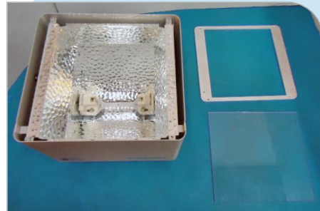
Figure 1. Lamp with Filler Plate Removed