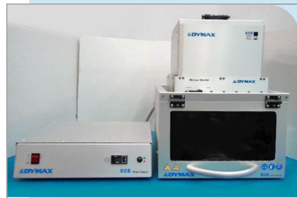
Figure 7. Assembled System

For detailed operating instructions, please refer to the ECE Flood Lamp User Guide.