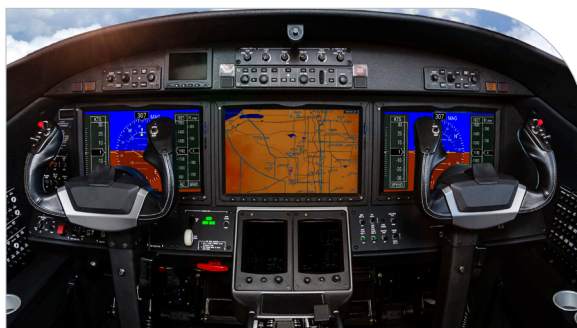
Optical bonding increases clarity, viewing angle, and vibration resistance

The “on-demand cure” of these adhesives allows substrates to be repositioned precisely until parts are ready to be cured. Using a thin layer of Dymax adhesive controls cost and can reduce the weight of the final product. The adhesive also acts as a barrier against stress, significantly improving product reliability and warranty costs. Dymax display adhesives come in a variety of viscosities for ease of use and controlled dispensing and are available in a wide range of packaging sizes.