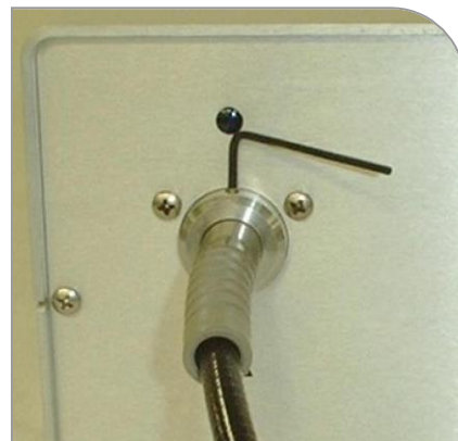
Figure 2. Tighten Set Screw with Hex Wrench