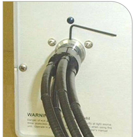
Figure 2. Tighten Set Screw with Hex Wrench