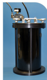
Bottle Drop-In Reservoir