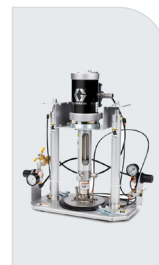
Mini Ram Pump