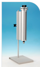
12 oz (300 mL)