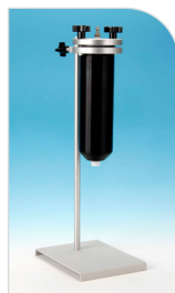
20 oz (550 mL)