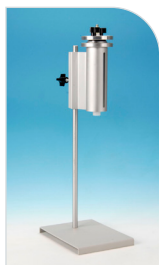
6 oz (160 mL)

*KFM (fluoroelastomer) seals are not compatible with UV-curable adhesives