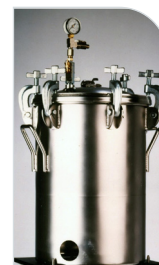
Pail Drop-In Reservoir