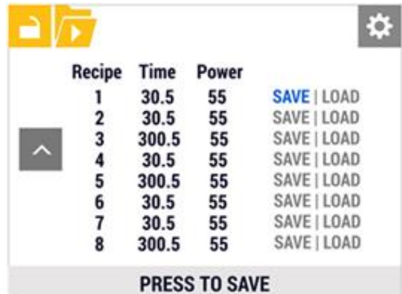
Figure 6. Press to Save