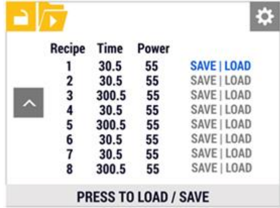
Figure 4. Recipes