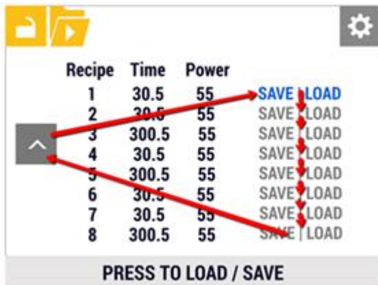
Figure 5. Navigation