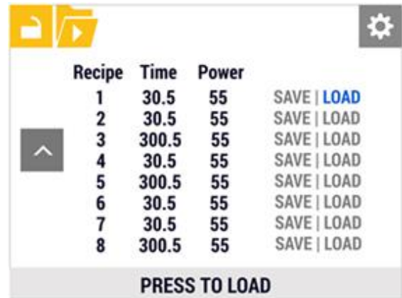
Figure 8. Press to Load

10. After pressing LOAD , the “LOAD SUCCESS” screen will show for approximately 1.5 seconds (Figure 9).