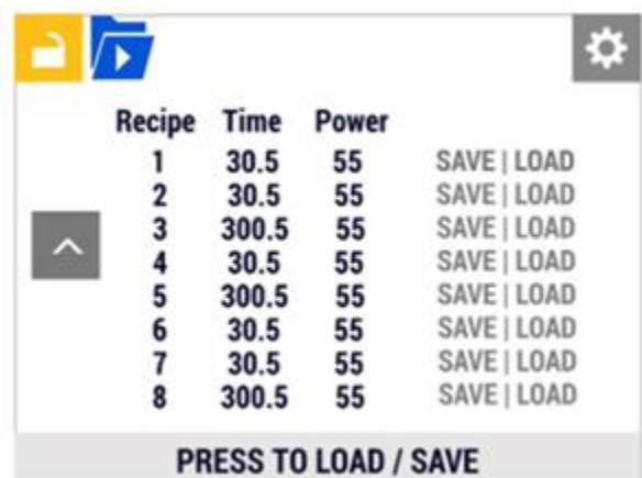
Figure 10. Back

12. Pressing the rotary push-button again when the cursor is on the BACK button in the recipes screen you will go back to the main menu (Figure 11).