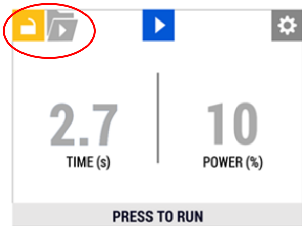
Figure 1. Admin Mode