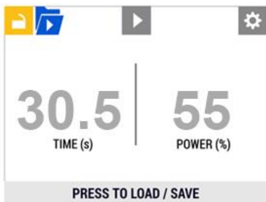
Figure 11. Main Menu (Admin Mode)